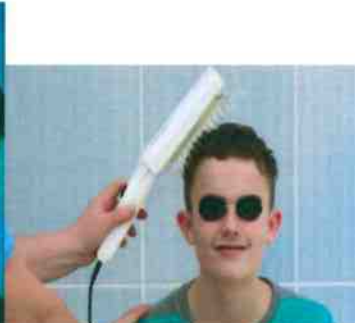
UVB 311 COMB